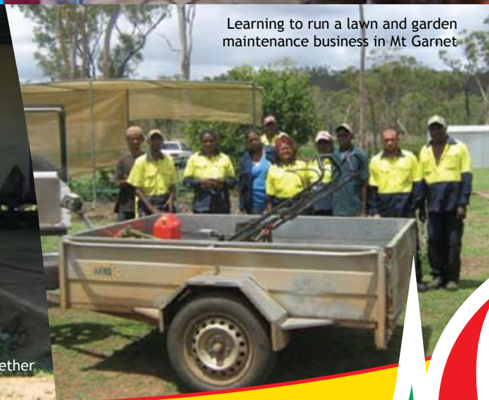
Learning to run a lawn and garden maintenance business in Mt Garnet