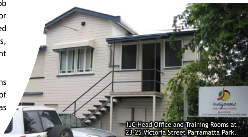
IJC Head Office and Training Rooms at 23-25 Victoria Street Parramatta Park.