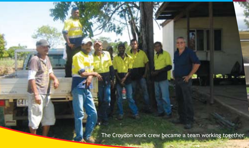
The Croydon work crew became a team working together